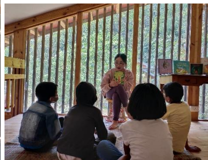
Met exchange students in Duitsland